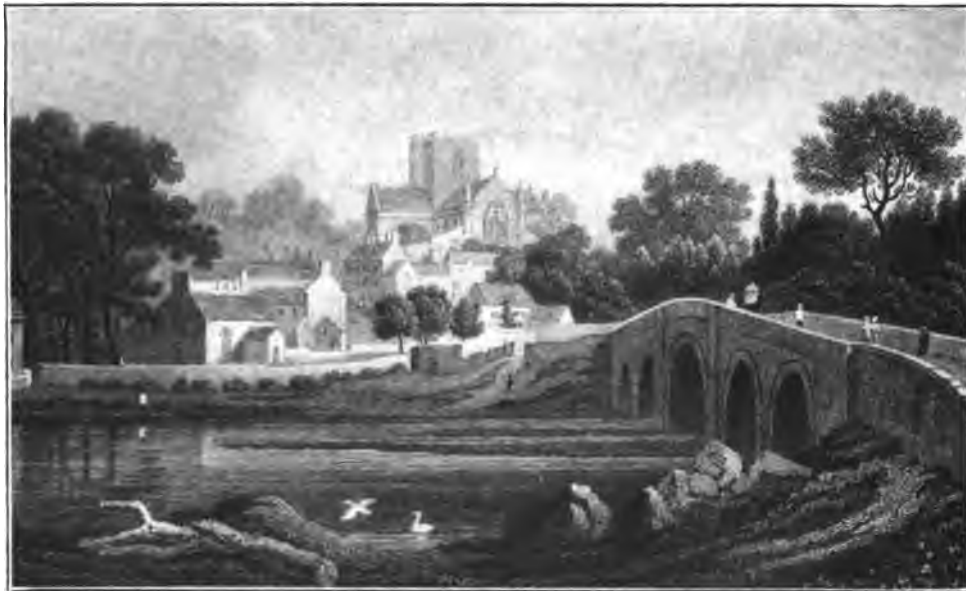
ST. ASAPH VILLAGE